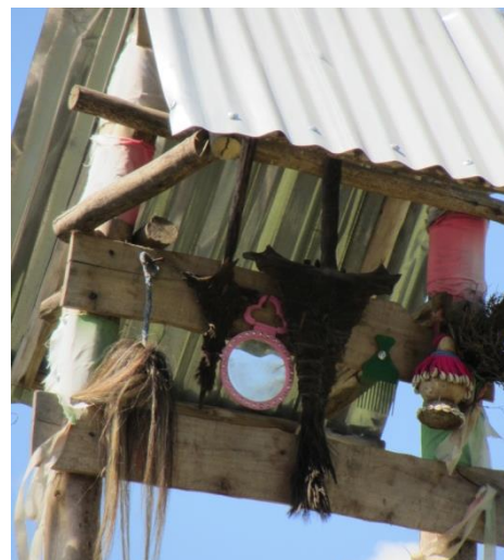
Facha trophies displayed in area neighbouring Diga